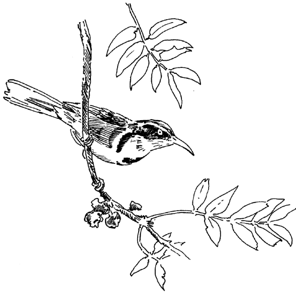
Crescent Honeyeater (drawing by Fiona Lumsden)

More than 250 species of birds have been recorded in the central Blue Mountains area. Here you'll find many different habitats in close proximity – it's possible to visit lush rainforest gullies and eucalypt woodland within minutes of walking on a windswept rocky heathland.