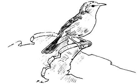
Rockwarbler ( Origma solitaria )